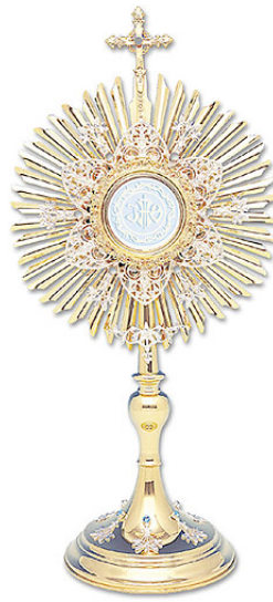
Clip and Save