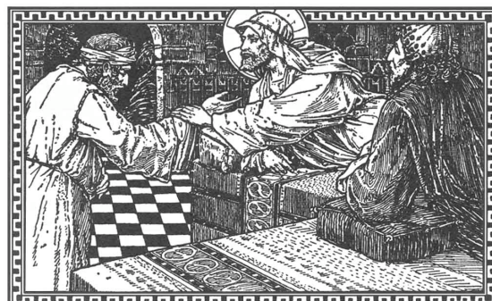
But He, taking him, healed him.

Dress Code: Ladies—Please wear a modest dress and a head-covering. No tight fitting, low-cut, short, slit, or sleeveless dresses. No pants or shorts. Men & Boys—Please wear a shirt and tie, with either suit coat, jacket or sweater, and dress shoes. No T-shirts, sweat shirts, sweat pants, tennis shoes, sneakers, shorts, jeans or Sports logo jackets.