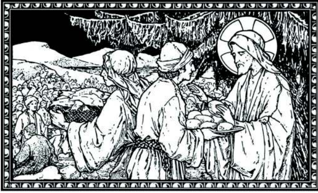
The multiplication of the loaves, a type of the Christian Passover