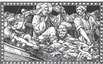
From henceforth thou shalt catch men