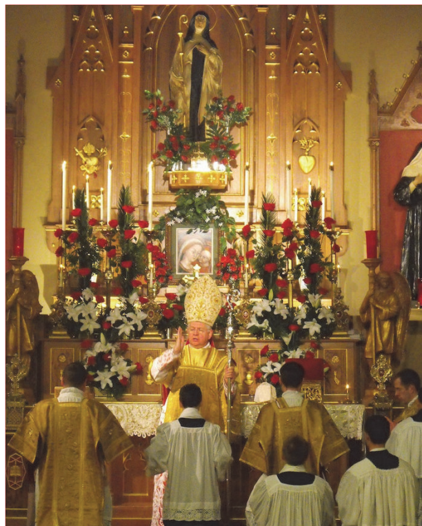
The Feast of St. Gertrude the Great afforded us the opportunity to honor our patroness with a pontifical high Mass – a rarity on a Sunday. A celebratory reception featuring a Mexican menu was held following the morning's ceremonies in honor of our visiting guests from Baja California.

How better to thank Him for being with us, for sharing our misery, than by sharing Him with as many souls as possible? This conviction inspires our apostolate here, our many comings and goings, our words and deeds: to bring Christ to souls. Thank you for allowing us to bring Christ to you and yours