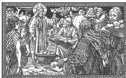
JESUS FEEDS THE FOUR THOUSAND