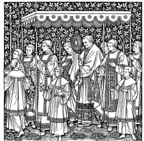
Jesus in the Blessed Sacrament, have mercy on us.