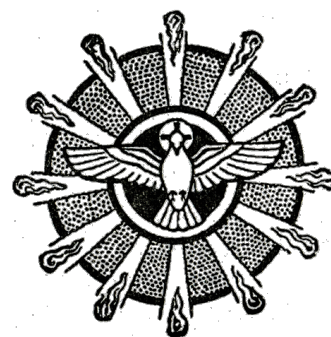
Hail, glorious Side, riven for us with the soldier's lance.

Oh, I'm glad you asked. It's the Holy Ghost. Ghost means spirit or life in German, and we inherited it in English, meaning only and specifically one holy spirit, God the Holy Ghost. There was no need to change it, but the modernists did, years ago. We don't follow the changes, because we're Catholics. Some do, of course, but it's a shame to give up so rich and proper a part of our English language. Besides, it sounds funny and out of place in our prayers, once you understand it.