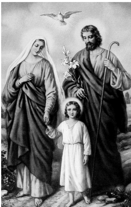
Jesus, Mary, Joseph!

The picture of the Holy Family should be in every household; it is a perpetual reminder, placed in tangible form, of our dear Lord, our Blessed Lady, and our friend, St. Joseph, who were the members of the Holy Family. We often are interested in the pictures of great persons, and take delight in representations of angels and holy people. What is the secret of this inclination? Why, we can see those whom we wish to imitate, and grow to know their good and holy lives through their pictures. The Holy Father has approved one special picture which is to be the emblem of this association: Mary and Joseph, holding the youth Jesus between them by the hand. Jesus is not an infant, for this picture is to bring to mind the fact that His parents had to suffer care and anxiety in order to bring Him to this stage of boyhood, for which noble duty they were fitted by special providence and by special faithfulness. (This is the Holy Family statue enshrined in our church.)