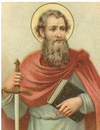
Thou art the Vessel of election, St. Paul the Apostle, the Preacher of truth in the whole world.

Our annual novena to the Sorrowful Mother with the Blessing of the Sick continues this Friday. Bring your sick to be blessed, and be sure to call or email the office with their names to be mentioned in the novena.