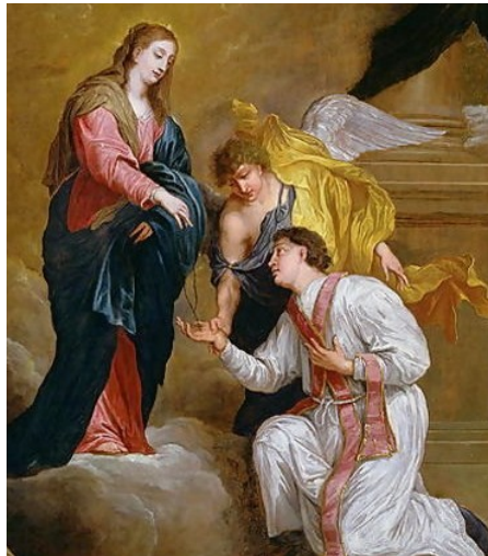
St. Valentine, pray for us. Protect our young people, bless our courting couples.

📖 Set Your Missal: Quinquagesima, second collect of St. Peter Damian. Trinity Preface.