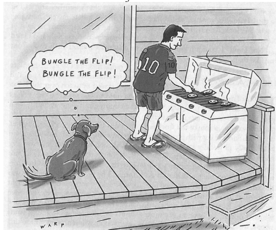
Cartoon for the Fourth

He acts most nobly who forgives his adversary and is reconciled to him. George Washington, the renowned liberator of the United States, when only twenty years of age, had a dispute with a fellow-officer, and, as he was apt to do, expressed himself with undue vehemence. The other officer gave him a blow which felled him to the ground. Every one expected that Washington would challenge his opponent, but he did not do so. Acknowledging that he began the quarrel, he went to the officer the next day, and said: “To err is human. I insulted you yesterday, and you took satisfaction. If you consider that satisfaction sufficient, let us be friends. Here is my hand.” The officer took the outstretched hand, and the two were good friends ever after.