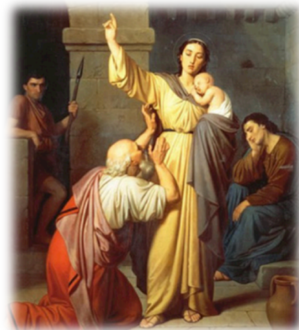
Ss. Perpetua & Felicity

📖 Set Your Missal : Second Sunday of Lent, second collect of the Saints, third for the Church. Preface of Lent.