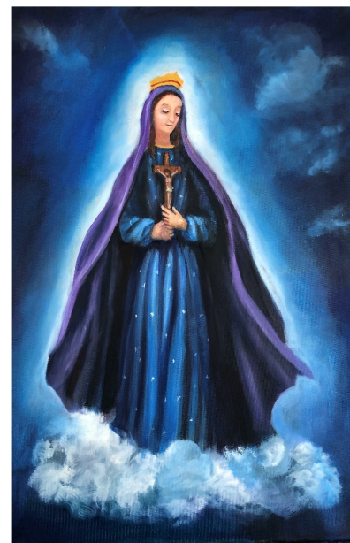
Our Lady of Pontmain / Our Lady of Hope 18" x 24" Framed Oil Painting by parish artist