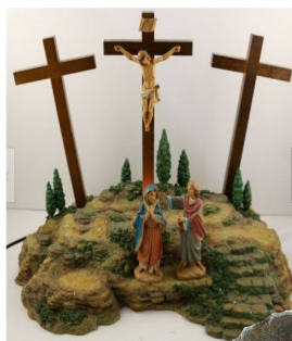
Fontanini Heirloom Crucifixion & Light up Resurrection Set 5" Figures Original Boxes

A salesperson will ask you to purchase or stop in the bookstore.