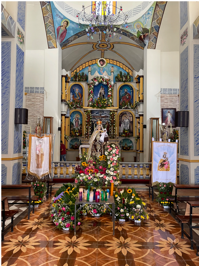
Aside from the Divine Mercy picture, it is quite a beautiful church.

Father has been in Dos Rios for some fifteen years now, doing most of the work on the church himself. You can see a picture of his church below. He tells me that he plans a major project in the construction of his church each year, taking six months to plan it out and go door-to-door asking for alms, and then six months putting it into execution. The plan this year is to build a larger sacristy off to the Epistle side of the sanctuary as well as guests' quarters for visiting clergy. He is a hardworking and zealous priest whose example I found to be quite edifying.