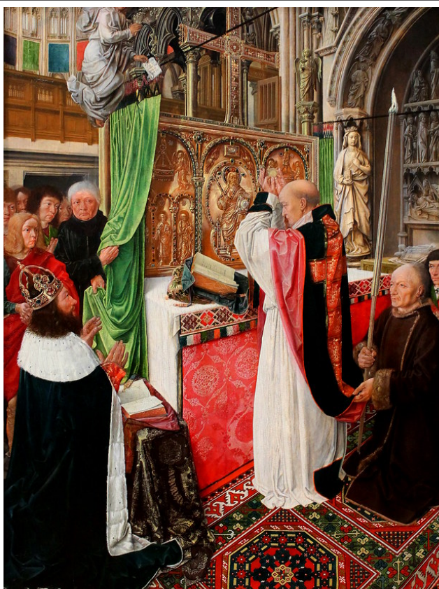
The Mass of St. Giles

Tuesday is the feast of great Pope St. Pius X. Come to Mass to honor him and to pray especially for the Church.