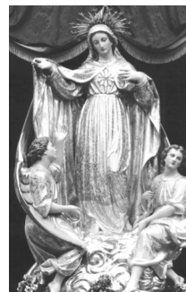
— Francis Thompson

Then rest a little; and in sleep Forget to weep, forget to weep!