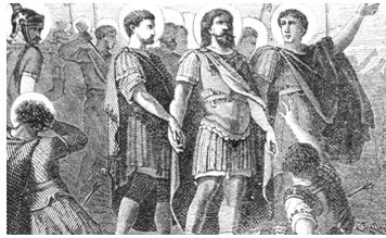
St. Maurice & Companions

with much progress for the Christian religion." – St. Jean de Brébeuf (†1649), French Jesuit missionary and martyr, served longest among the North American Martyrs, and authored the first catechism in North America.