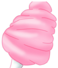
Our New Addition Cotton Candy!