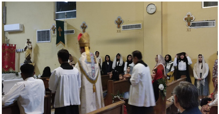
Confirmations in Tijuana