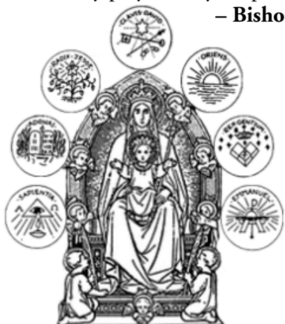
GAUDE GAUDE EMMANUEL, NASCETUR PRO TE ISRAEL