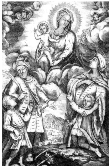
Ss. Marius & Companions

The same applies for Masses submitted for the Missions. We cannot guarantee they will be sent to a particular priest. Mission Masses are sent in the order they are received to whichever priest is in need. Thank you for your understanding and continued support. May God reward your generosity!