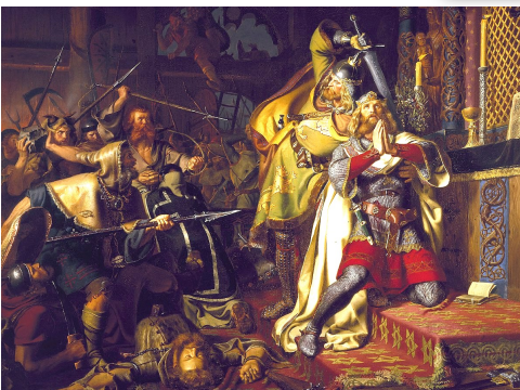
Martyrdom of St. Canute