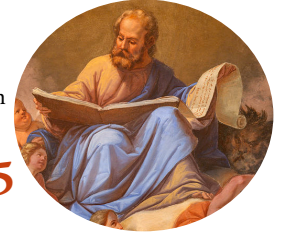
St. Mark, Ev